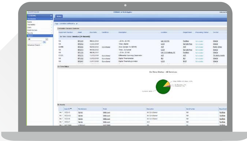
Custodian Dashboard in CERDAAC

WuXi also uses the CERDAAC Cases module for out of tolerance report investigations, and for reports and KPI monitoring. “For this year to date we have 45% of our cases closed within their due date – which is much higher than it used to be,” says Moline. “It used to be around 10%. That’s a huge step in the right direction, and I think as more people get used to completing that electronic workflow, we’re going to see that number continue to improve. We are trending in the right